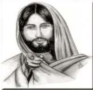
Jesus Wants YOU ACTS 1:8

ANNIE ARMSTRONG EASTER OFFERING® FOR NORTH AMERICAN MISSIONS